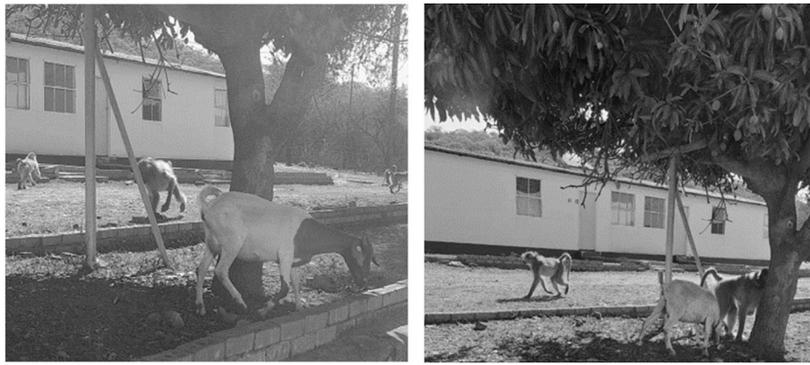
Fig. 2. Human-wildlife-livestock interface, baboons and goats foraging under a mango fruit tree at the staff quarters at Epoch Mine campus, Insiza District, Mat-abeleland South (Photo credits: Nokubonga Ncube, April 2023).

foot from their sleeping sites to distinguish the troops and make the baboons accustomed to the observer (Ndagurwa, 2007). The three troops have distinct sleeping sites; One at the Trukumb mine, the second on the northwestern side of the campus (staff quarters and the library), and the third on the southern side (close to the recreational facility). With the aid of binoculars (Sterriah 12x50 Optics, China), troops were trailed in the morning (from 5.30 to 9.00 a.m.) collecting the fresh faecal samples immediately after defecation or when the baboons had left the immediate foraging area (Katsvanga et al., 2009; Adrus et al., 2019; Larbi et al., 2020).